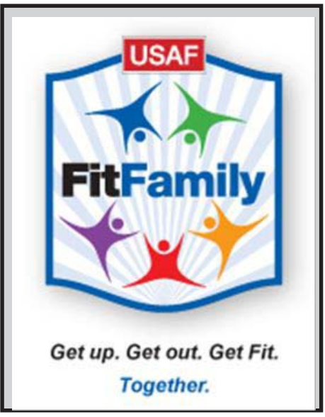
FitFamily is an Air Force program that encourages families to "get up, get out and get fit together."

To enroll in the FitFamily program, families need to log on to http://www.USAFFitFamily.com and click on "Register My Family." The system will send a password to each family member's